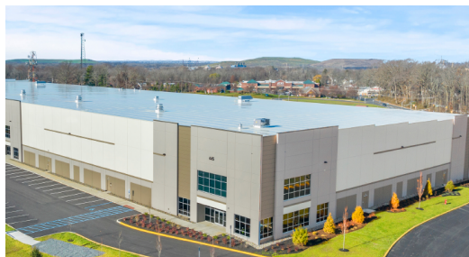
First Bordentown Logistics Center Bordentown, NJ