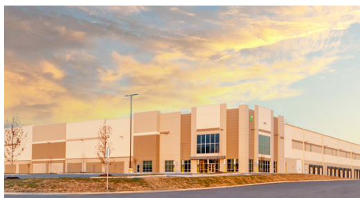
First Logistics Center @ 283 - Building A Elizabethtown, PA